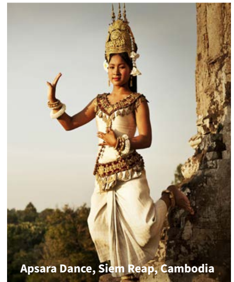
Apsara Dance, Siem Reap, Cambodia