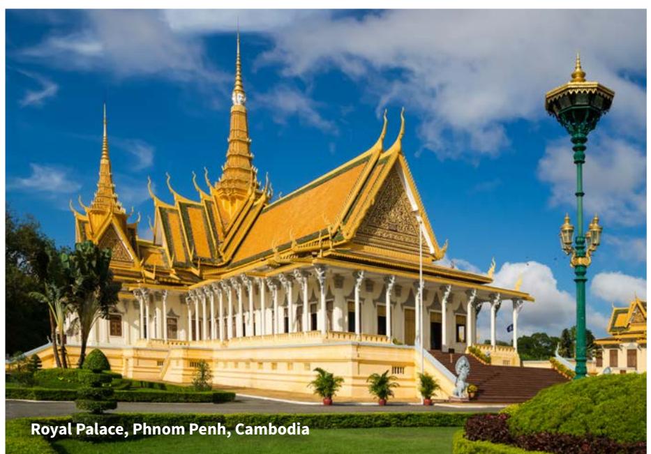
Royal Palace, Phnom Penh, Cambodia

ASIA VACATION GROUP PTY LTD (ABN: 74 608 656 800)