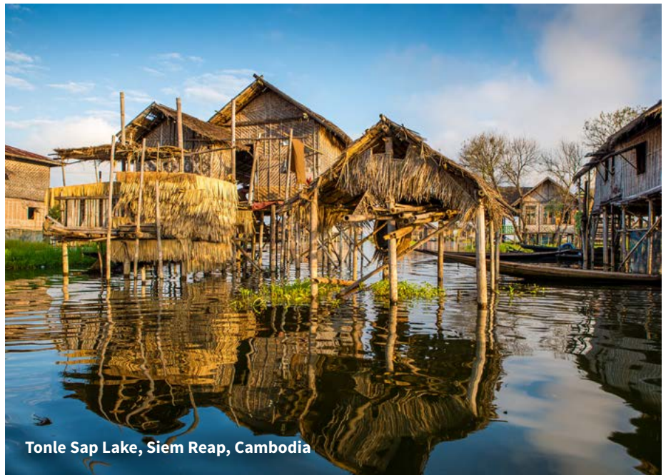
Tonle Sap Lake, Siem Reap, Cambodia