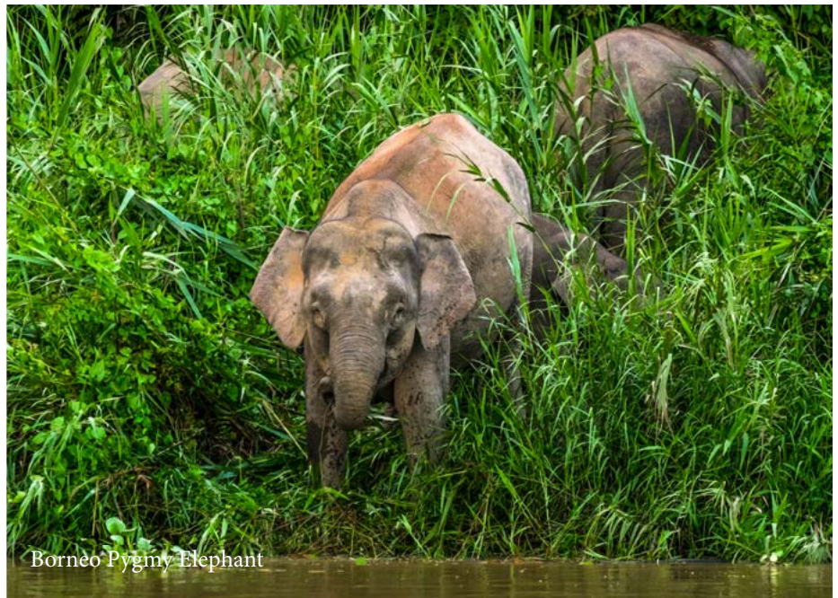
Borneo Pygmy Elephant

This morning, take a flight to Sandakan then set off to Selingan Turtle Island. Spend today at your leisure to go swimming, snorkel or just relax at the beautiful beach. After dinner, you will have a chance to observe Green