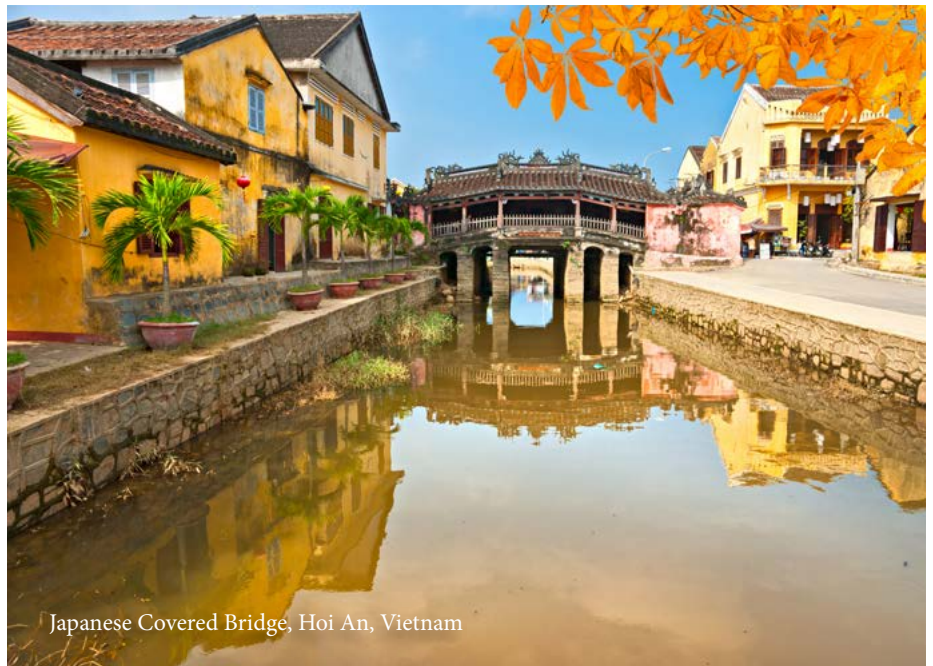
Japanese Covered Bridge, Hoi An, Vietnam