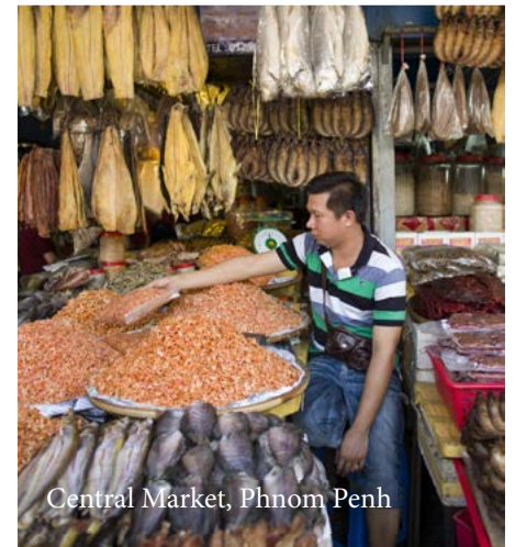
Central Market, Phnom Penh