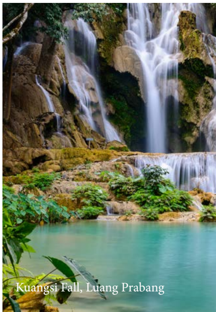
Kuangsi Fall, Luang Prabang