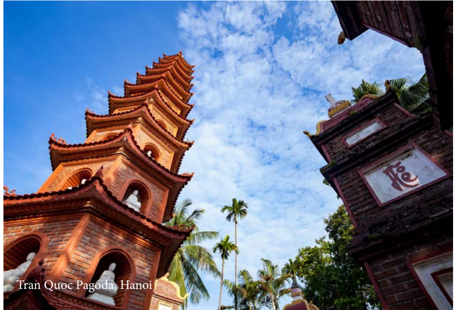
Tran Quoc Pagoda, Hanoi