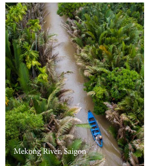
Mekong River, Saigon

On arrival in Mandalay, get transferred to your hotel for check-in. In the afternoon, take a half-day Mandalay city tour to Mahamuni Pagoda, Mandalay Palace, Kuthodaw