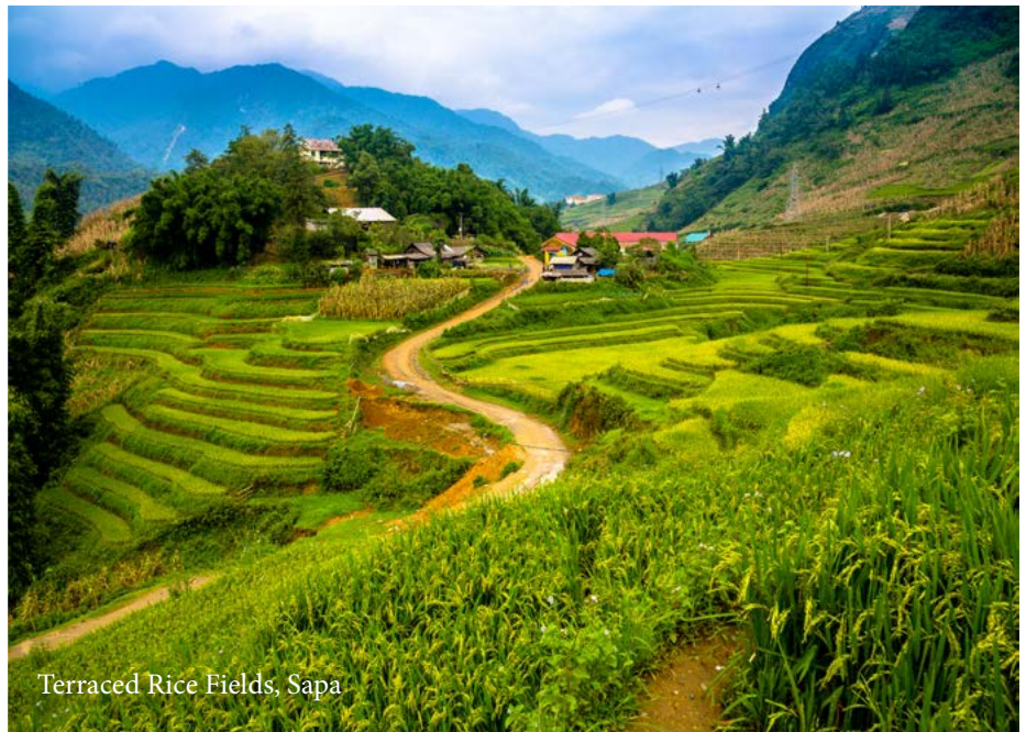
Terraced Rice Fields, Sapa

Awake early and join a Tai Chi session on the top deck or simply enjoy the sunrise over the bay's towering islands. After lunch on board, disembark and take a drive back to