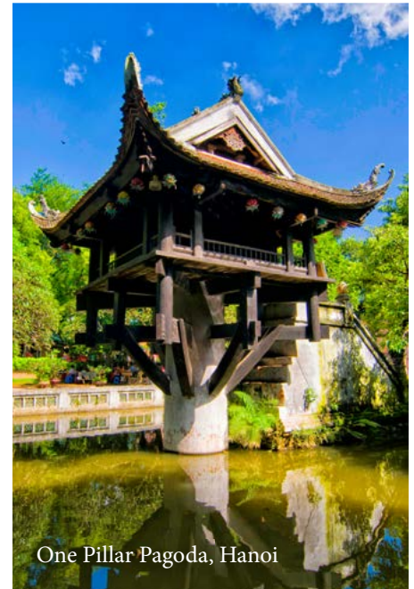
One Pillar Pagoda, Hanoi