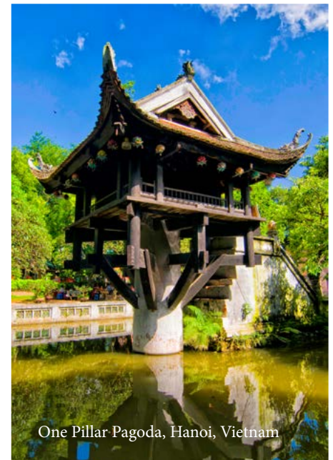
One Pillar Pagoda, Hanoi, Vietnam