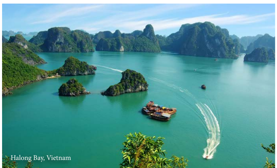
Halong Bay, Vietnam

ASIA VACATION GROUP PTY LTD (ABN: 74 608 656 800)