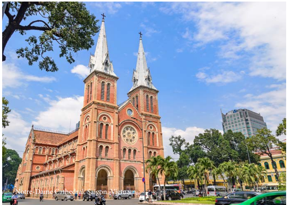
Notre-Dame Cathedral, Saigon, Vietnam