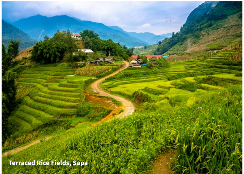
Terraced Rice Fields, Sapa

After breakfast, take a Hanoi city tour to Ho Chi Minh Mausoleum, One Pillage Pagoda and the Temple of Literature.