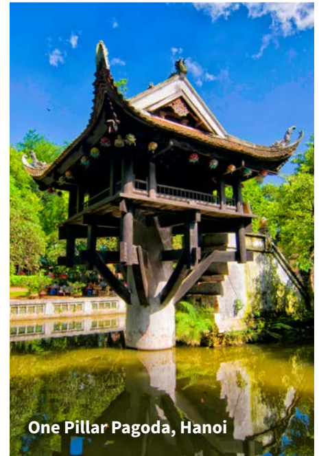
One Pillar Pagoda, Hanoi