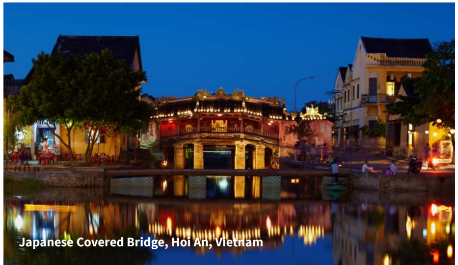
Japanese Covered Bridge, Hoi An, Vietnam