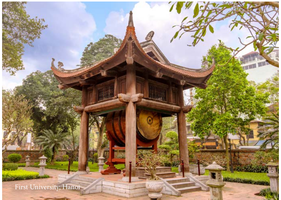
First University, Hanoi