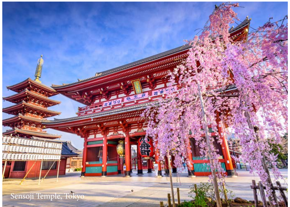
Sensoji Temple, Tokyo

After breakfast, head to Nara to explore Todaiji Temple, Nara Deer