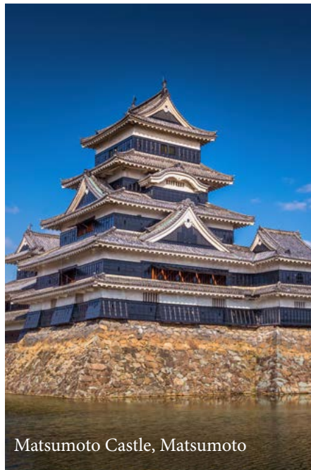
Matsumoto Castle, Matsumoto