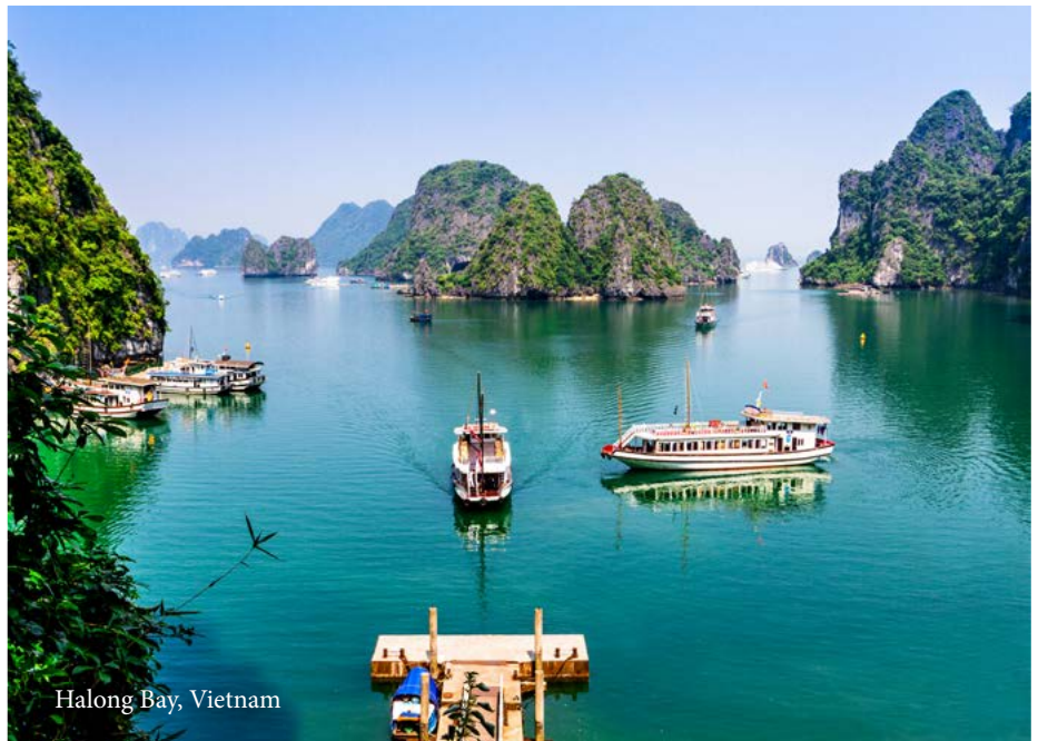
Halong Bay, Vietnam