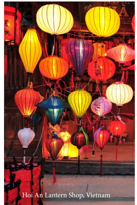
Hoi An Lantern Shop, Vietnam

ASIA VACATION GROUP PTY LTD (ABN: 74 608 656 800)