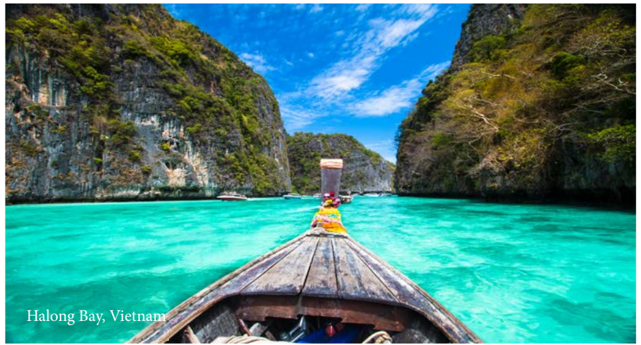
Halong Bay, Vietnam

Explore Hoi An's highlights including Hoi An Museum, Old Merchants' House, Assembly Hall and the Japanese Covered Bridge. Stroll along the peaceful Thu Bon River, one of the world's most famous trading ports in the past. This afternoon, get ready for a flight to Saigon.