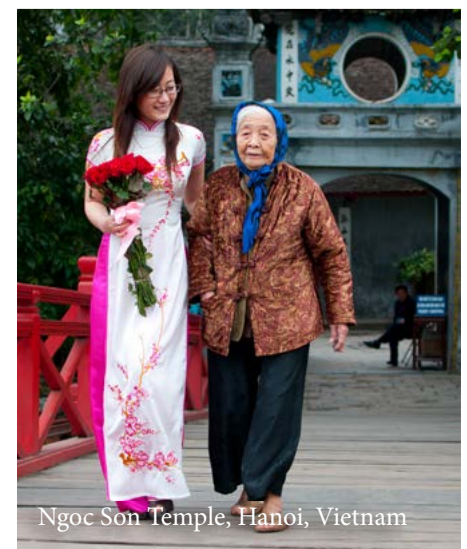
Ngoc Son Temple, Hanoi, Vietnam

ASIA VACATION GROUP PTY LTD (ABN: 74 608 656 800)