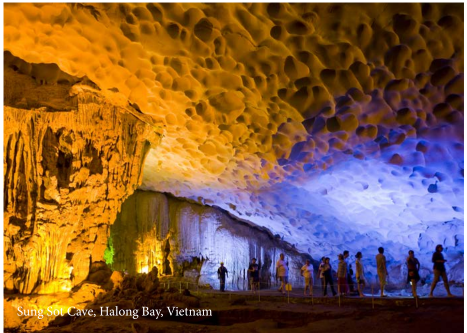
Sung Sot Cave, Halong Bay, Vietnam