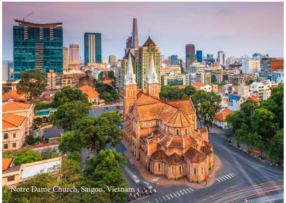
Notre Dame Church, Saigon, Vietnam