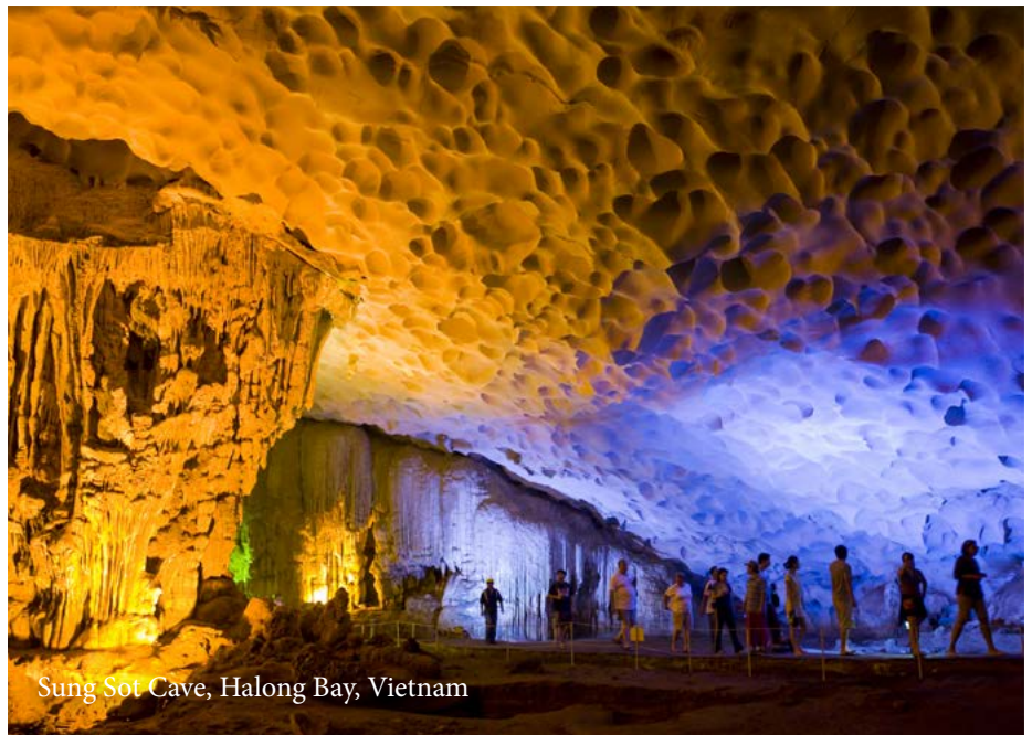
Sung Sot Cave, Halong Bay, Vietnam