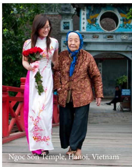
Ngoc Son Temple, Hanoi, Vietnam