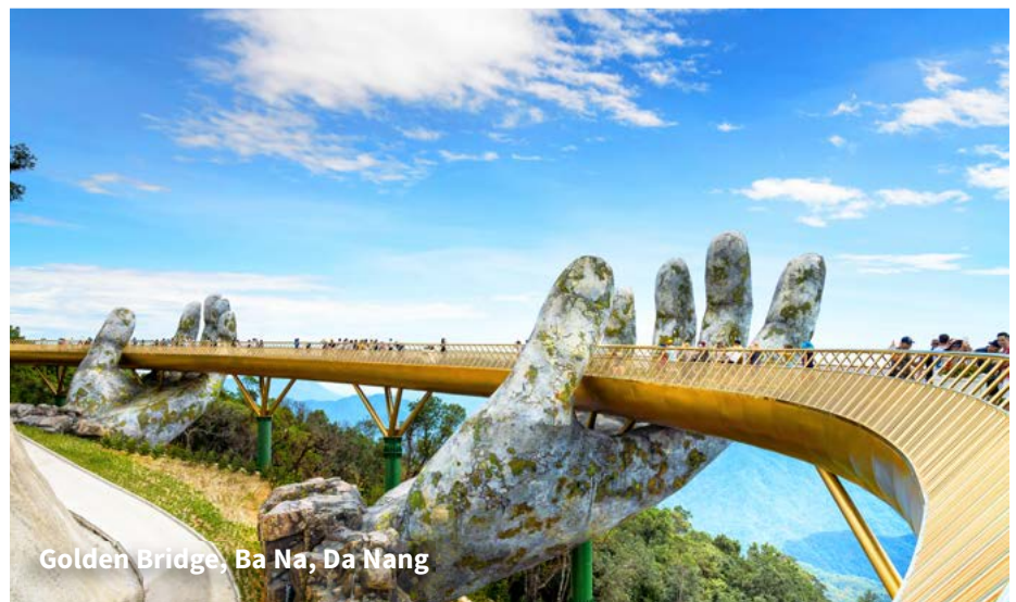
Golden Bridge, Ba Na, Da Nang

ASIA VACATION GROUP PTY LTD (ABN: 74 608 656 800) 📍 Suite 902, 11 Queens Road, Melbourne VIC 3004