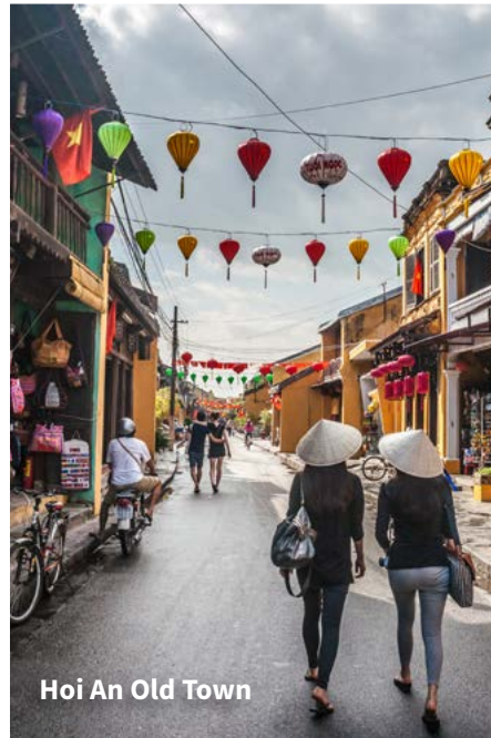
Hoi An Old Town