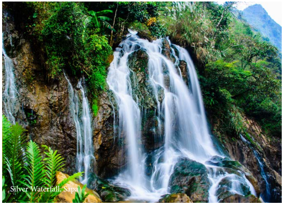
Silver Waterfall, Sapa

Awake early and join a Tai Chi session on the top deck or simply enjoy the sunrise over the bay’s towering islands. Explore the amazing rock formations of Halong Bay by rowboat. In the afternoon, meet your driver at