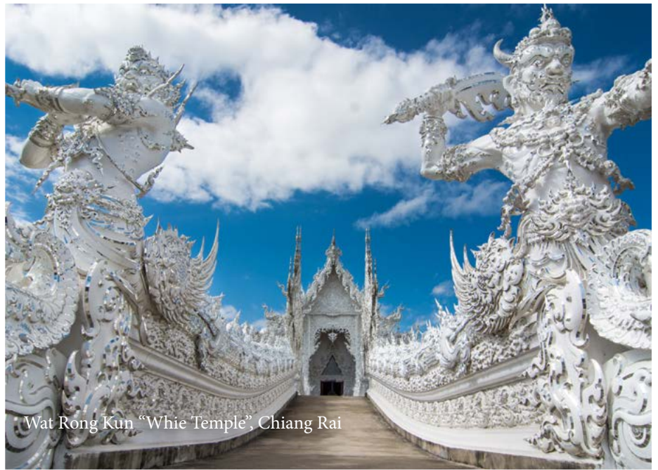
Wat Rong Kun "White Temple", Chiang Rai

Take a quick stop to northern Thailand's Karen Long Neck Hilltribe, who is known for boasting spiral brass coils around their necks. Afterwards, relax on the way back to the hotel. Then we return to the hotel where you are free at leisure.